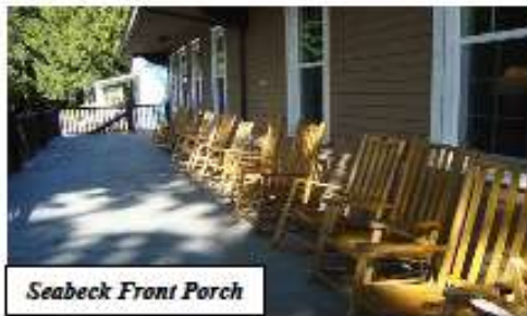
Seabeck Front Porch

“Life will take on new meaning. To watch people recover, to see them help others, to watch loneliness vanish, to see a fellowship grow up about you, To have a host of friends --- this is an experience you must not miss! P. 89 Big Book